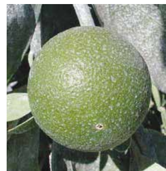
Figure 2: Needs re-application