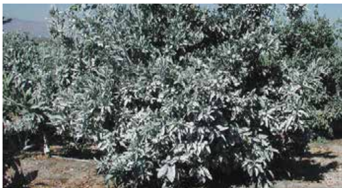
When coverage is maintained throughout the hot summer months, Surround improves foliar flushes in young trees.

Offering all these qualities, Surround represents a real breakthrough in plant surface protection.