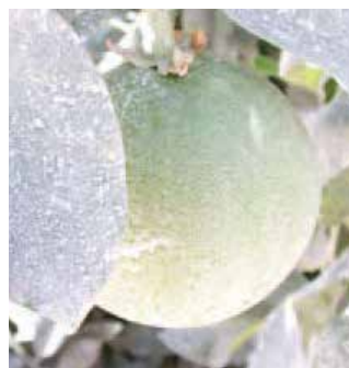
Figure 1: Well-coated fruit